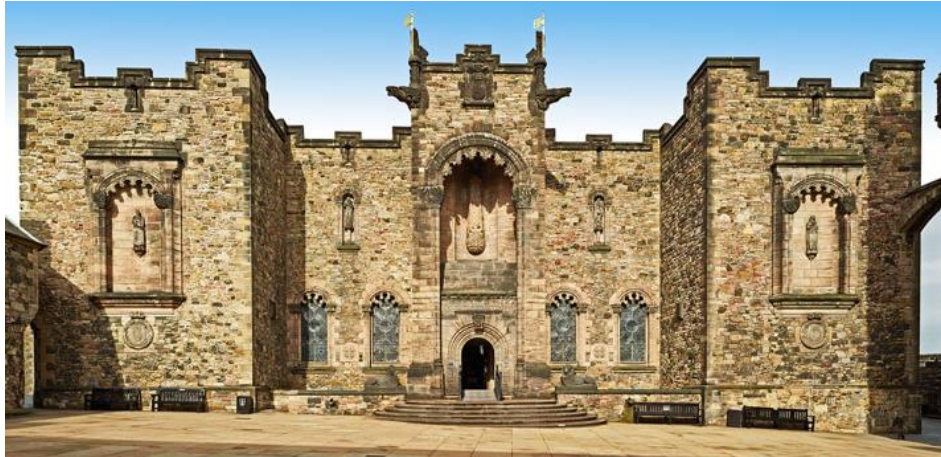
The Scottish National War Memorial & the Hall of Honour & the Roll of Honour books.