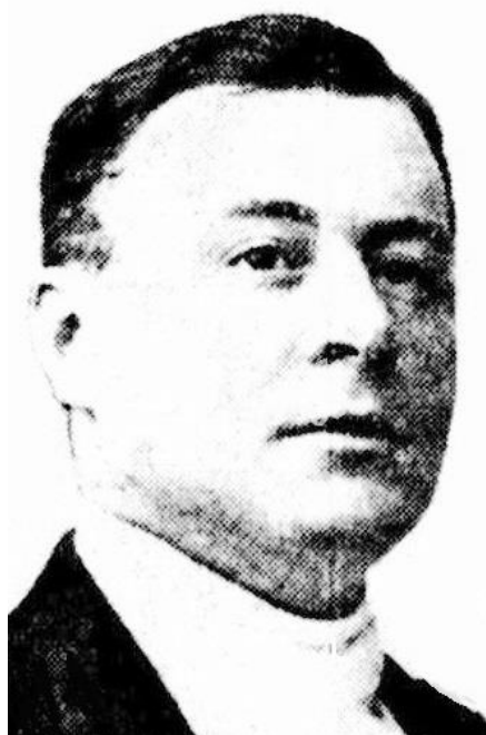
( The Sun , Sydney, NSW 20 January, 1919)